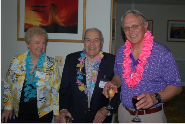
NCCOC 2 nd Quarterly Meeting, Kitty Hawk, NC April 1-2, 2016